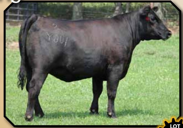
Sennett Agnes 106Y – She Sells as Lot 43.