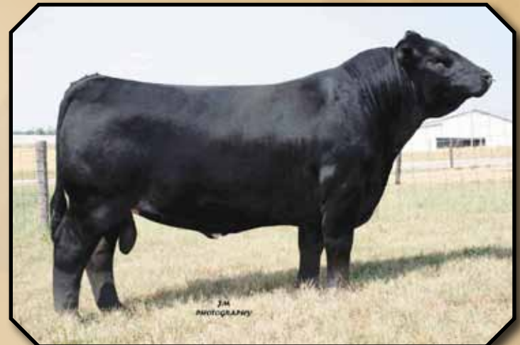
SS EBONYS GRANDMASTER – His influence sells.