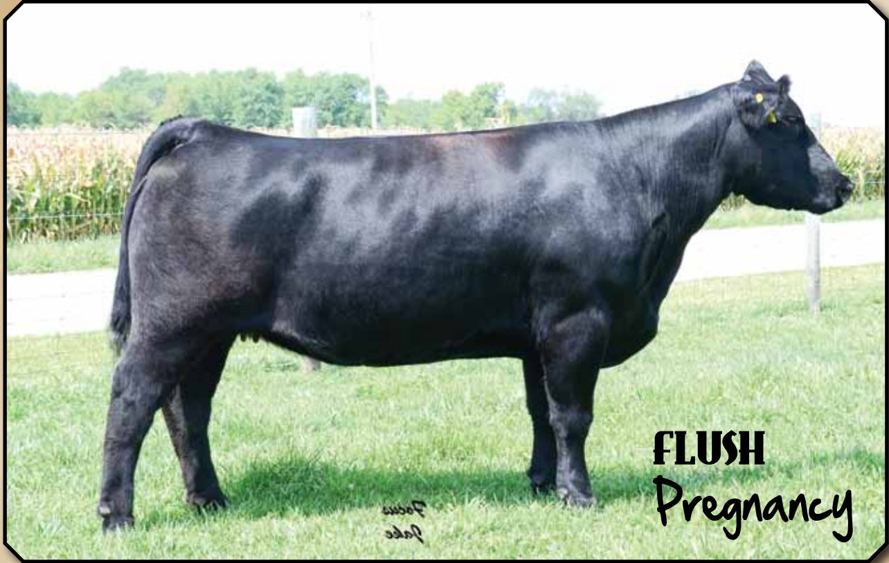
DAKT MARIE LEBOU – Donor dam of Lots 36 and 36A.

SELLING A FLUSH TO THE BULL OF THE BUYER'S CHOICE. Guaranteeing five transferable eggs.