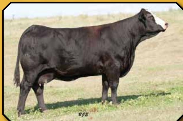
ETR MS BLACK CROCUS L105 – Dam of Lot 48