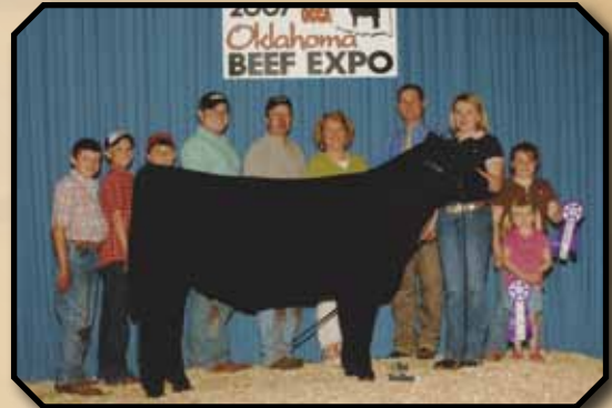
OKLAHOMA BEEF SHOW