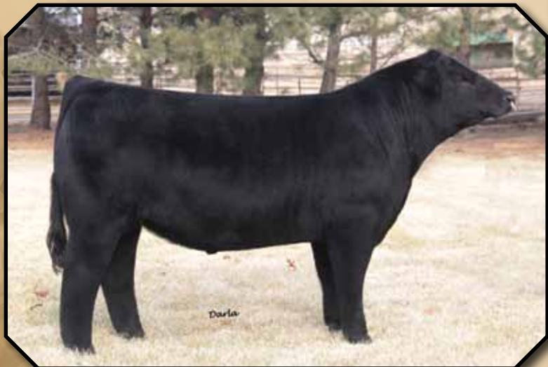
WAGR Upside - Sire of Lot 7A