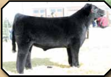
HAIRY BEAR – Sire of Lot 15.