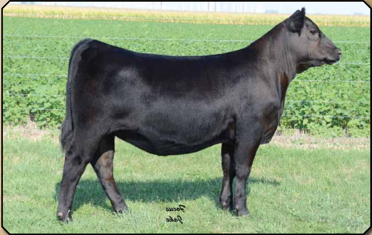
WLE BLACKCAP Z0020 – She sells as Lot 45.