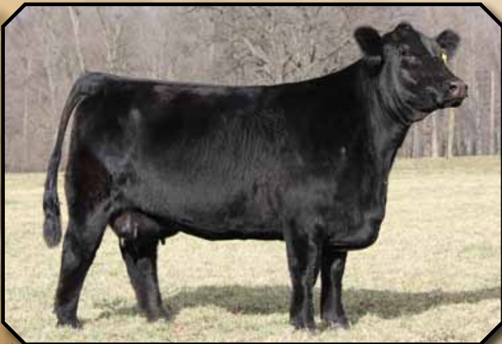
WLE MISSY U409 – Donor dam of Lot 39.