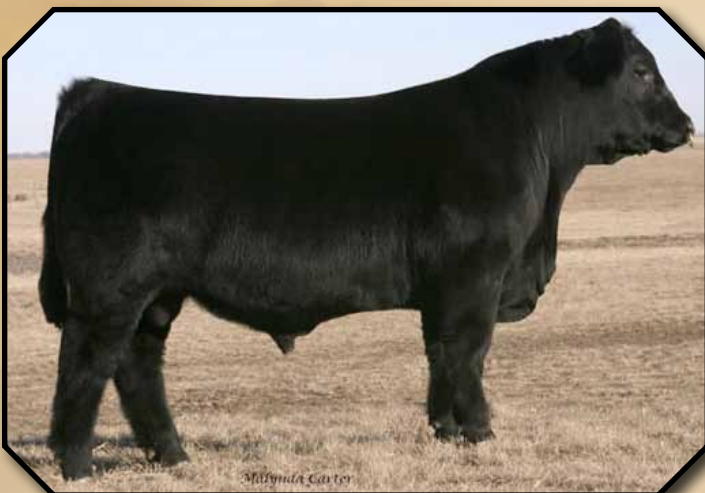
LAGRAN MAF ANTIDOTE 5775 – The $28,000 featured maternal brother to Lot 1.