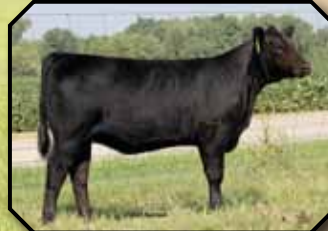
LAH EMPRESS 151Y - The $18,000 full sister to Lot 2.