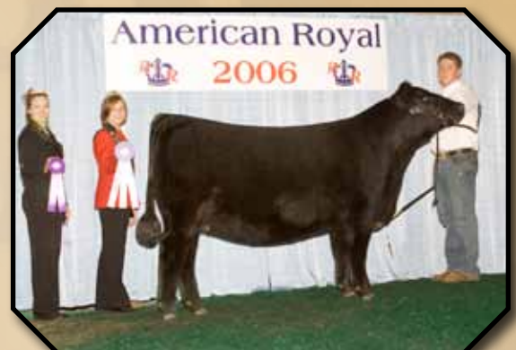
LAH SCC EMPRESS 516 - The 2006 Reserve Grand Champion Female of the American Royal and full sister to the dam of Lot 2.