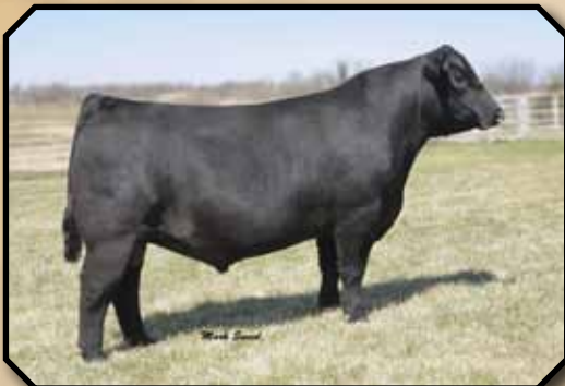
S A V BRILLIANCE 8077 – Sire of Lot 45.