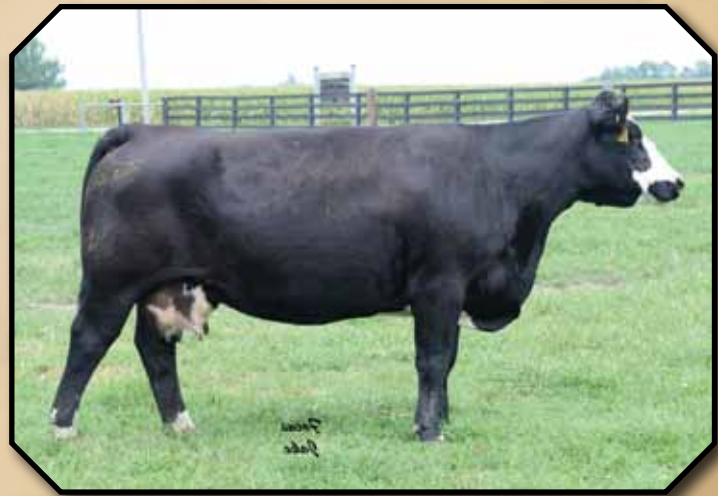
LAH SYDNEY ANNA 303N – Donor dam of Lot 16.