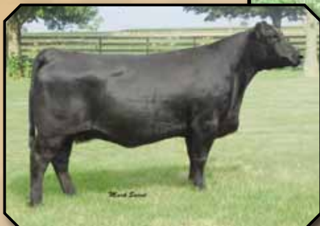
CHAMPION HILL LADY 2182 – The grandam of Lot 4.