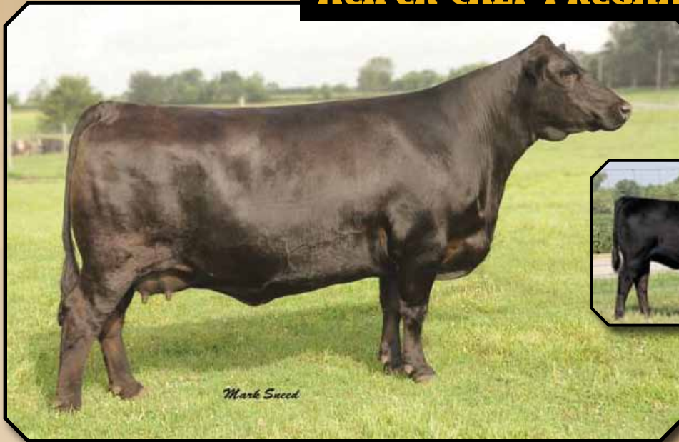
LAH Famous Empress 415 - Dam of Lot 2