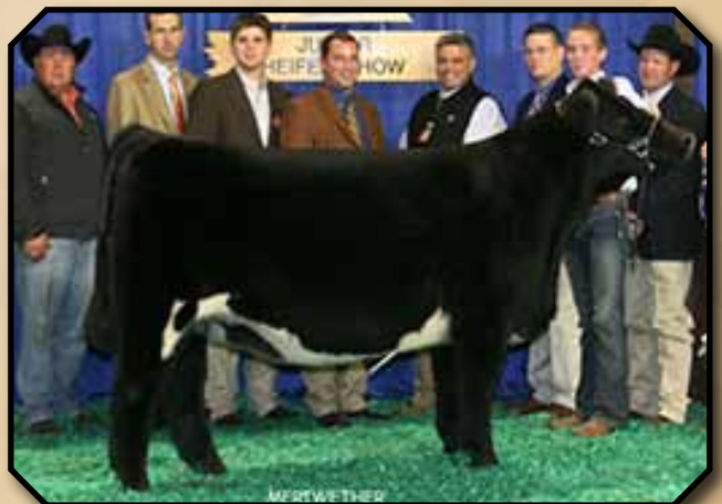
SULL HOT TAMALE – Maternal sister to Lot 40.