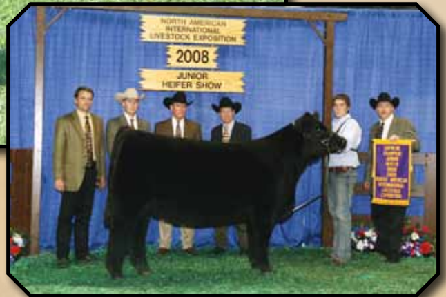
GCC ALL RIGHT ALL READY – Donor dam of Lot 40.