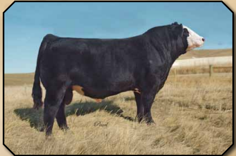
REMINGTON LOCK N LOAD - Sire of Lot 7D.