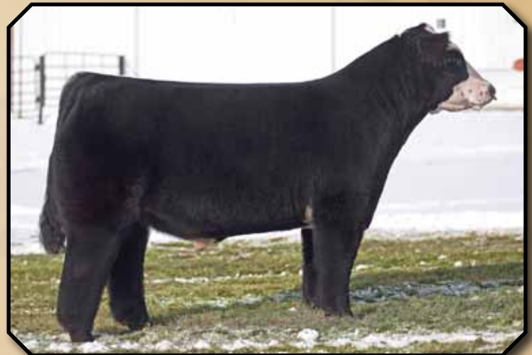
ONE AND ONLY – Sire of Lot 39.