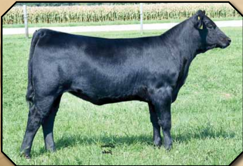
LAH EMPRESS 228Z - She sells as Lot 2A