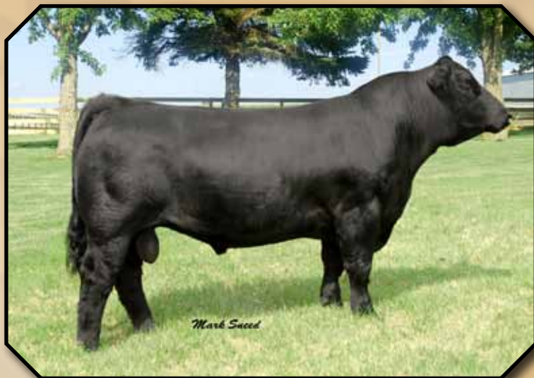
LAH SUE 604S – Son of Lot 5.