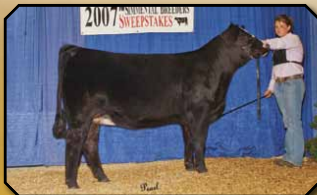
WLE Crocus S105 - maternal sib to Lot 48