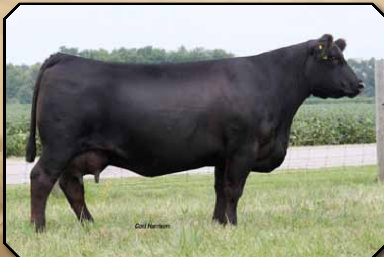
HB MS SHOWGIRL S611 – The $10,200 featured dam of Lot 8.