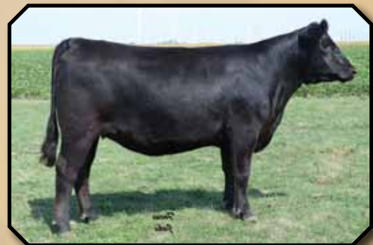
WLE MISS MAY Y30 – She sells as Lot 46.