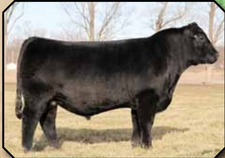
PR BLACK FRIDAY 0244 – The $96,000 valued sire of Lot 3.