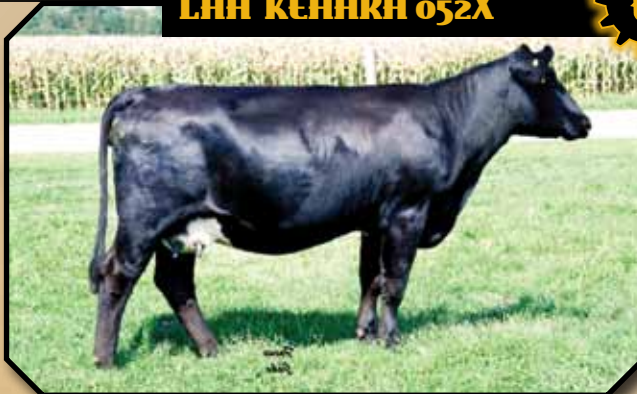
LAH KEHARA 052X - She sells as Lot 6.