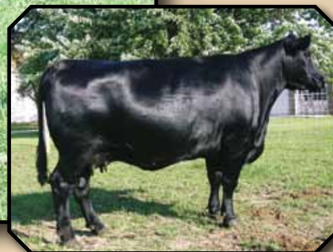
MAPLE LANE FOREVER LADY 277 – Dam of Lot 1