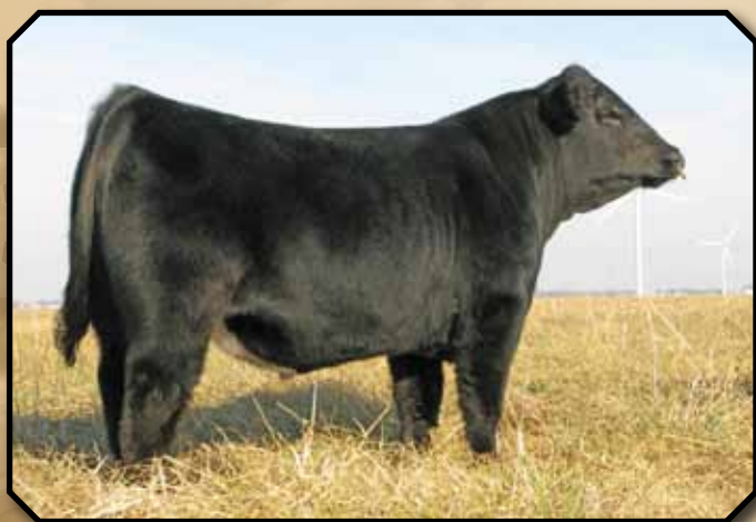
WLE UNO MAS X549 – His influence sells.