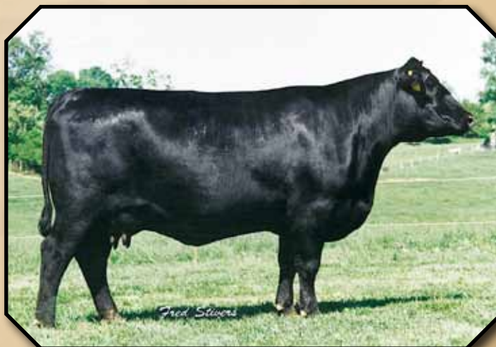
SVF FOREVER LADY 1120 – The $2.5 million producing grandam of Lot 1.